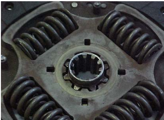
← Photo #2 Shows hub boss relative to the flange. Allows for idle rattle suppression