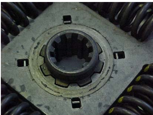
← Photo #5 Non idle rattle disc showing hub boss keyed to the hub flange and no small damper springs at hub